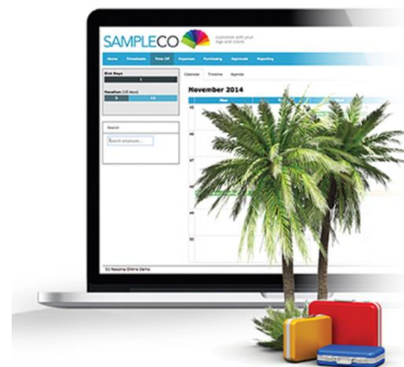
Nexonia Time Off on the

Have questions about your Nexonia account? Visit our Help Center: help.nexonia.com .